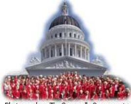
Photographer, Tia Gemmill, Sacramento